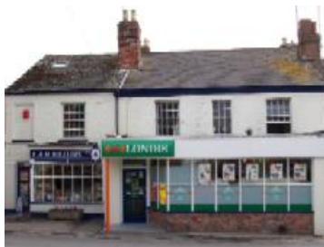
Londis Shop Lympstone