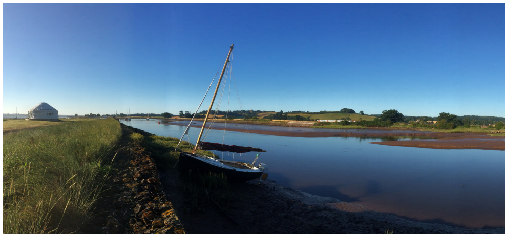
THOSE SAILING DAYS AREN'T FAR AWAY