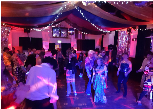
FANCY DRESS FUN AT THE SAILING CLUB DINNER DANCE