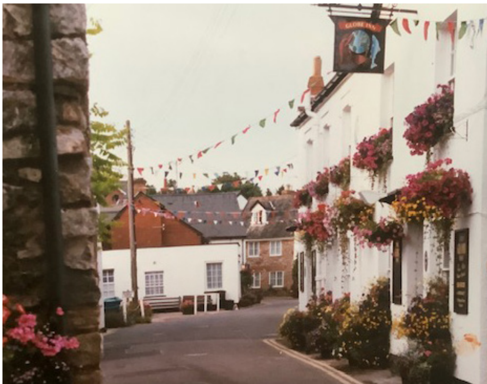
Photos from 1983 when Lympstone won the Britain in Bloom Trophy.