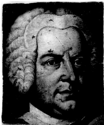
Johann Sebastian Bach