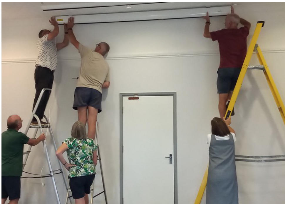
Village hall volunteers hard at work